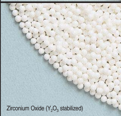
Zirconium Oxide ( Y_2O_3 stabilized)