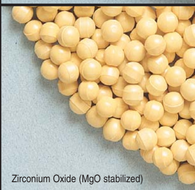
Zirconium Oxide (MgO stabilized)