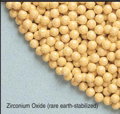
Zirconium Oxide (rare earth-stabilized)