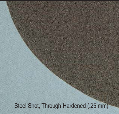
Steel Shot, Through-Hardened (.25 mm)