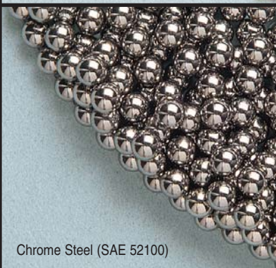
Chrome Steel (SAE 52100)