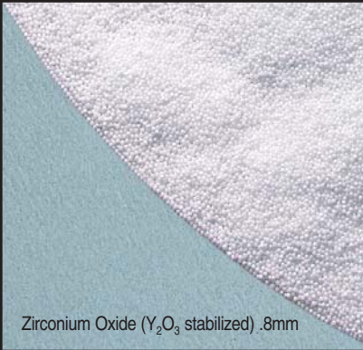
Zirconium Oxide ( Y_2O_3 stabilized) .8mm